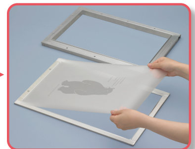
3 Stretch imaged screen on the frame