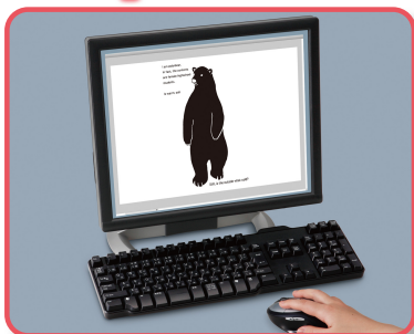
1 Create artwork