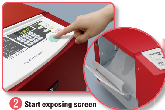
2 Start exposing screen